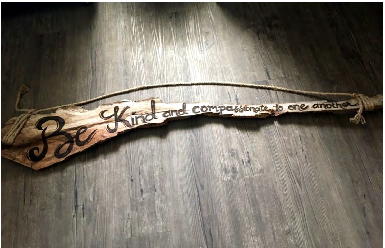
Art created and donated by Transition House resident