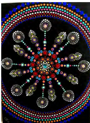
Art created and donated by Transition House resident

The program has had its times of challenge where teachable moments have given staff the opportunity to work together despite their differences. It is because of the staff and their passion to do the work they do, that the residential program has come to where it is today. The program has had several referrals from a local shelter agency, who states they have had great feedback from their clients who accessed residential services.